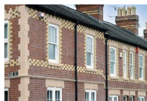
Knutton Terraced Housing

pictures courtesy of Urban Vision North Staffordshire – find more at www.uvns.org