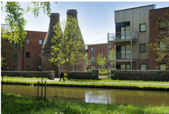
Lock 38 Housing Estate