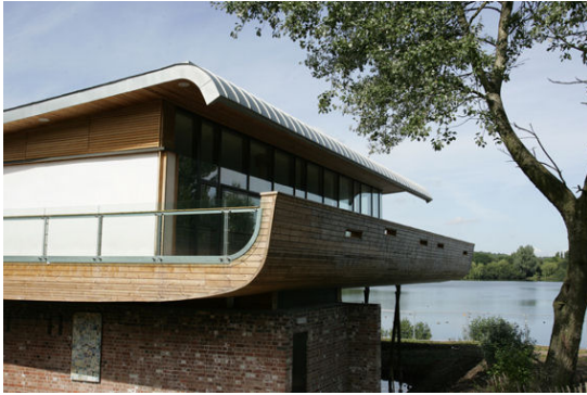
Westport Lake Visitor Centre - commended