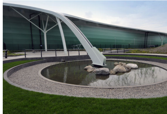
winner - Blue Planet eco-warehouse