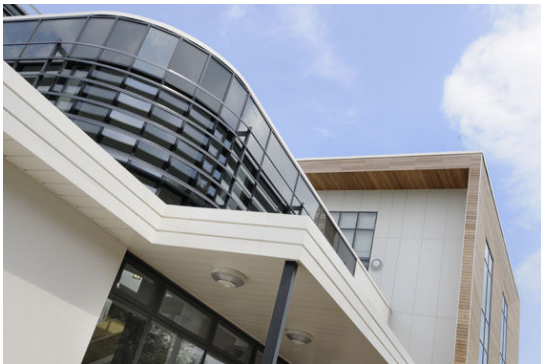
Caudon Campus Caring Centre of Excellence