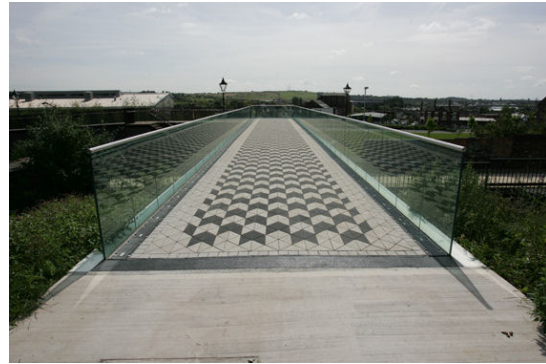
Bridgewater Bridge ...and outside the city